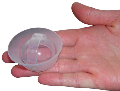
FIGURE 2: Femcap (courtesy of Alfred Shihata).

substance-using women suggests the same [64]. An energetic research agenda could bring large STI/HIV prevention gains to potentially diverse populations of women in need. Yet poor global promotion of this device has led to low clinician familiarity, negative attitudes, and consequent low awareness and demand among women [60, 65]. The cervical cap needs an influential champion.